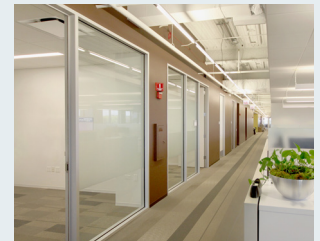
Tenant Office Area