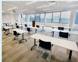
Tenant Training Room